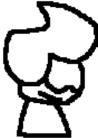
Top left: Hacking-Man